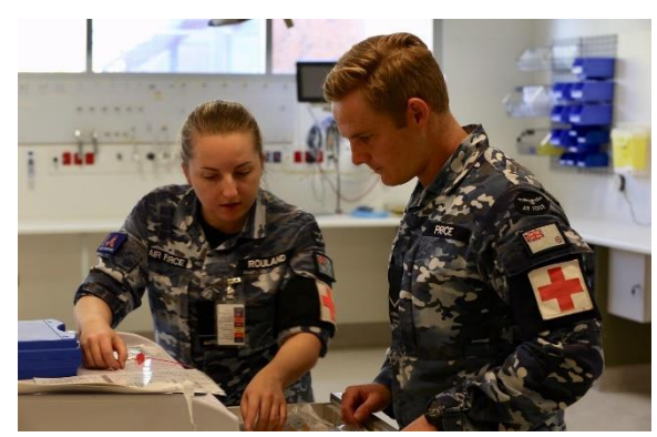
Figure 5 Australian Defence Force working at NWRH

Following the cleaning process and while staff completed their required quarantine requirements, the DoH engaged an Australian Medical Assistance Team, working with Australian Defence Force personnel, and provide service at the Emergency Department at the NWRH and assist the closure and reopening of health facilities and services including the MCH and NWRH.