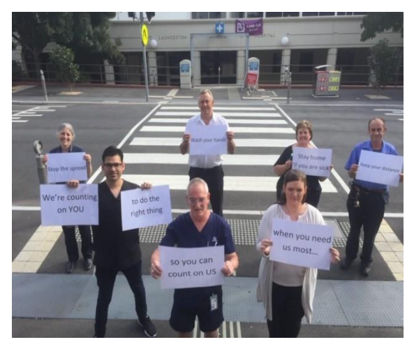
Figure 1 A team effort to tackle COVID-19

To all of our people: thank you. We simply could not have done this without you.